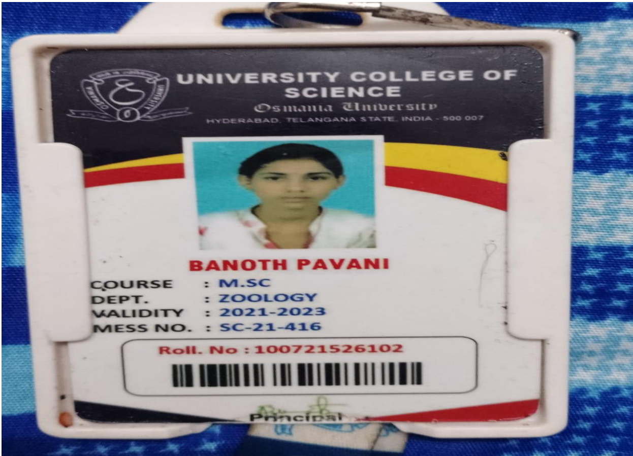
PG AT OU